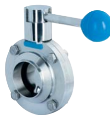
Type SS with manual actuator