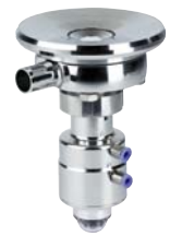
Tank bottom valve