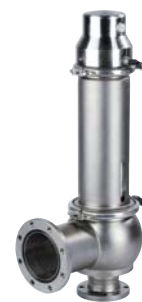
Spring-loaded safety valve