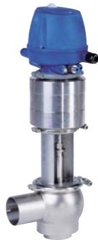
Single seat shut-off valve