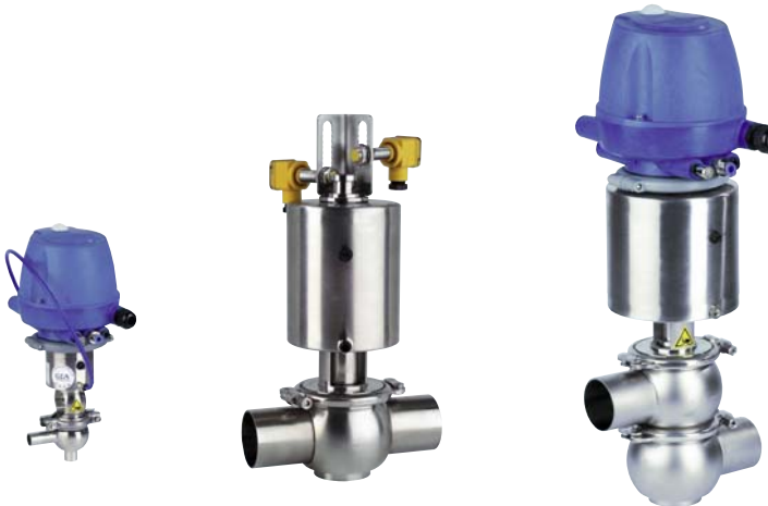
Single seat shut-off valve

With our ECOVENT® program, we offer a valve series covering single-seat and shuttle valves. ECOVENT® valves are based on the VARIVENT® philosophy and offer a cost-effective product with basic functions.