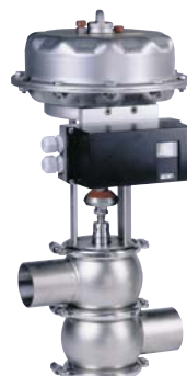
Modulating control valve