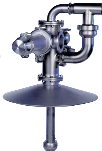
Installation using a central connection