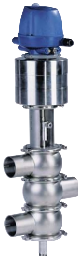
Mixproof shuttle valve