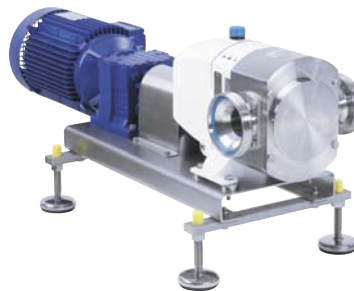
Rotary lobe pump