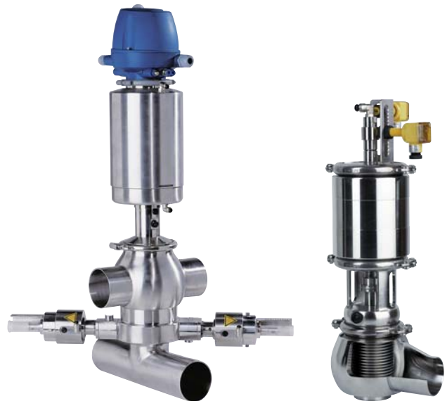
Double seal valve

The STERICOM® LongLife valve has been specially designed for aseptic applications in the dairy, beverage and food industries – where the perfect combination of cleanliness, gentle product handling, and a long life cycle are essential.