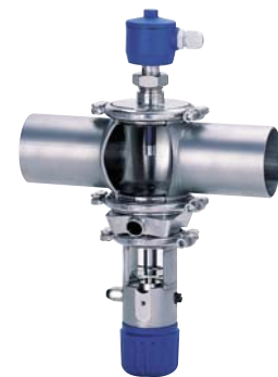
VARINLINE® housing with two process connections

The VARINLINE® system comprises sensors and transmitters for temperature, pressure, flow rate, liquid analysis, sampling, visual monitoring and level.